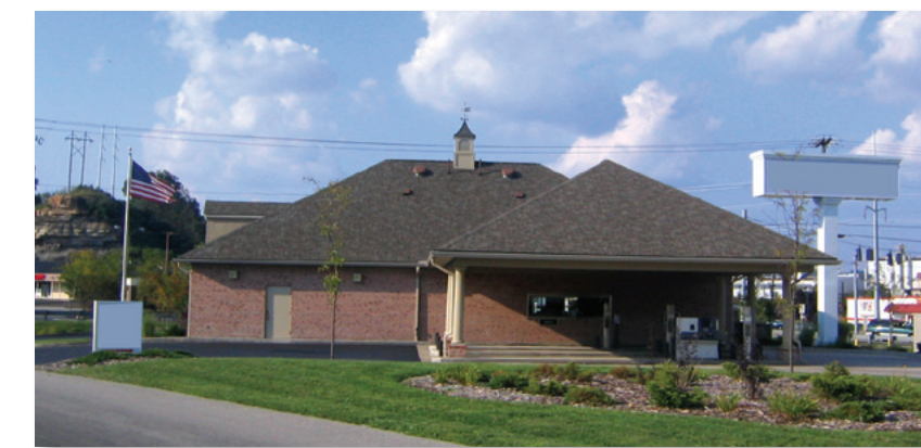
Newly Available Pad Building