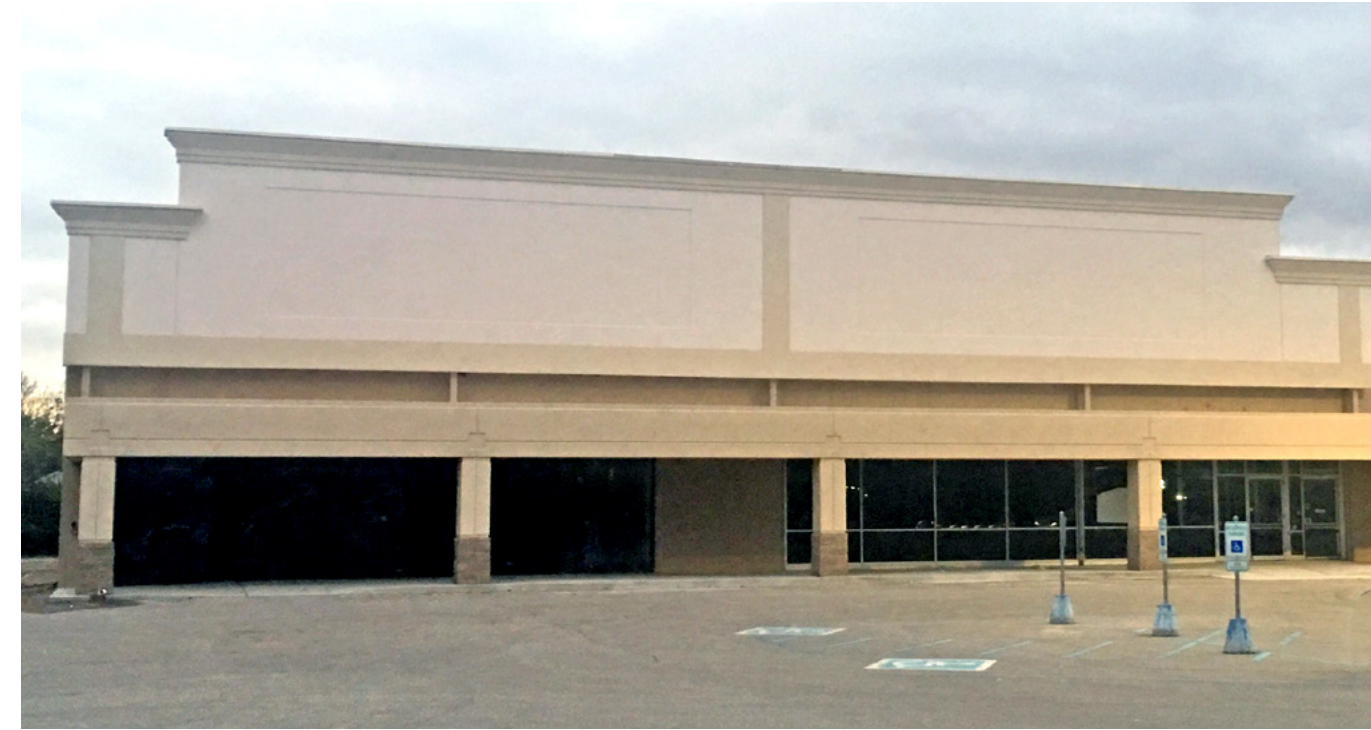
Newly renovated façade