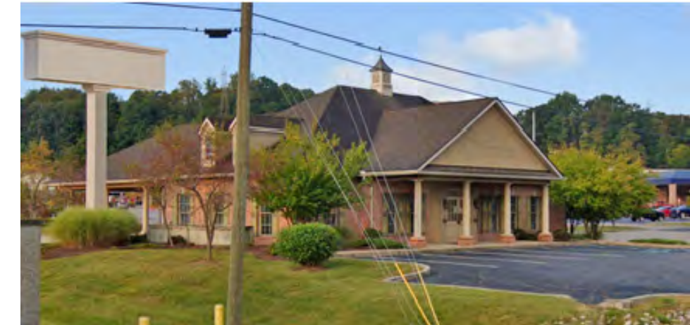
AVAILABLE PAD BUILDING WITH PYLON