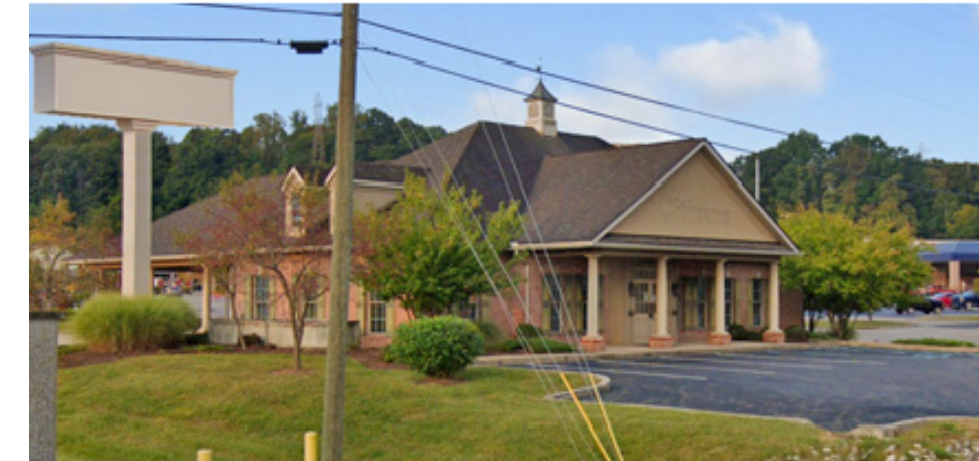
AVAILABLE PAD BUILDING WITH PYLON